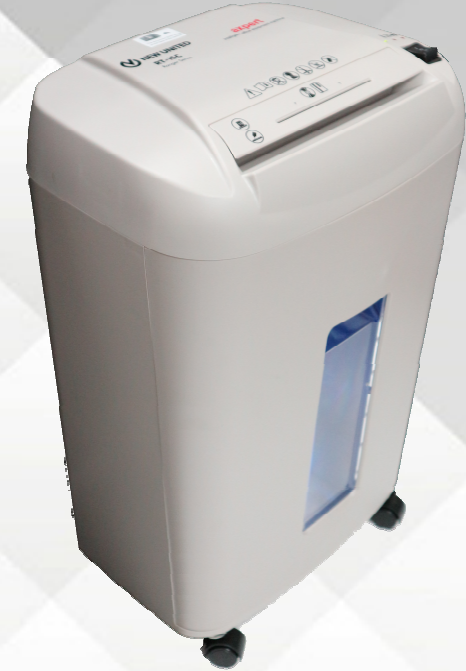
New United RT-15C Ranger Series